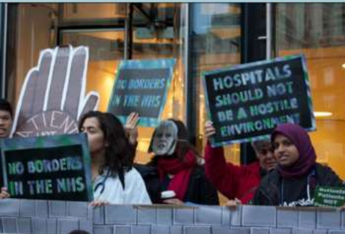
Challenging healthcare charging in the NHS