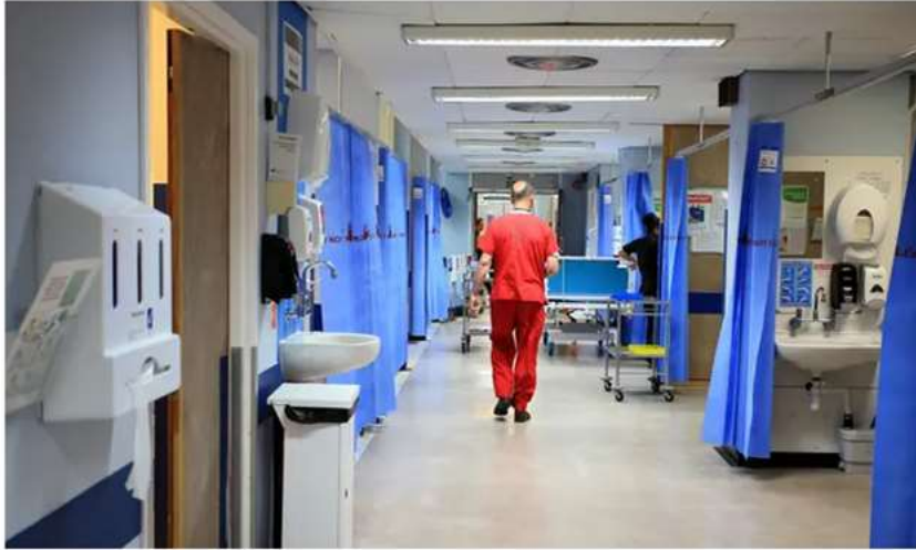
▲ Hospitals in England are mandated to check on the eligibility of overseas visitors to free NHS care.

Policy has resulted in deaths and been heavily criticised by MPs and health charities