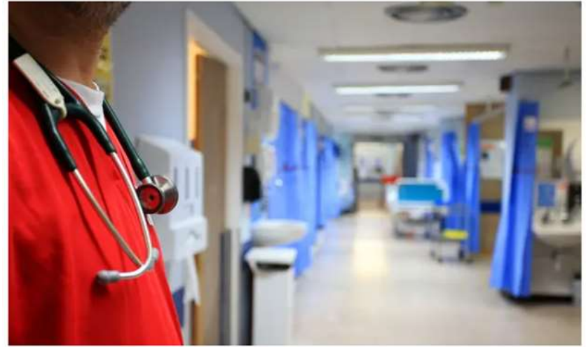
▲ The groups want an independent review of how the policy affects migrants' access to healthcare.

Policy has public health implications and is damaging doctors' morale, letter says